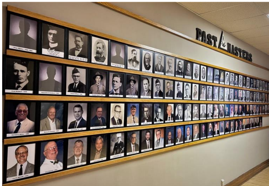
After 3 years of searching, 115 of the 120 different Past Masters pictures have been found. They are on display on the south wall of the dining hall. Local Masons and citizens can identify many of these Masonic names and/or families – starting before the Civil War in 1858.