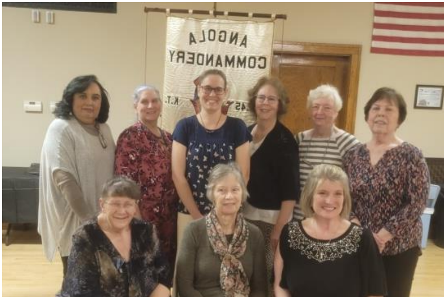
Ladies were invited and we had great turnout. We can't exist unless we have their support!