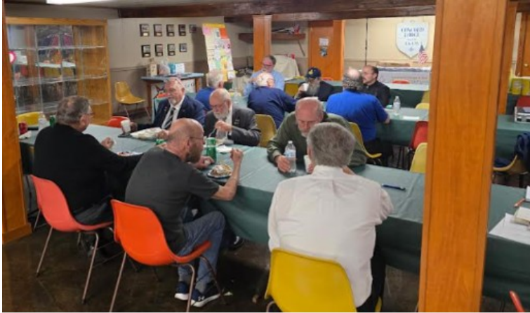
Dinner at Concord Lodge 556