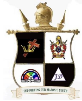
Grand Commander Randal Ellington Pin